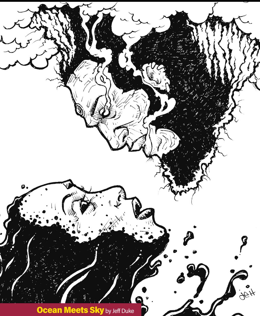
Ocean Meets Sky

The HIV Legal Network, African Caribbean Council on HIV/AIDS in Ontario (ACCHO), Africans in Partnership Against AIDS (APAA), and Black Coalition for AIDS Prevention (Black CAP) are located across this land now called Canada on treaty lands, stolen lands, and unceded territories of many different Indigenous groups and communities who have respected and cared for this land since time immemorial. Taking the lead from Indigenous communities, we work to address the ongoing injustices and resulting health inequities faced by Indigenous Peoples, which contribute to the disproportionate impact of the HIV epidemic and drug poisoning crisis on Indigenous communities.