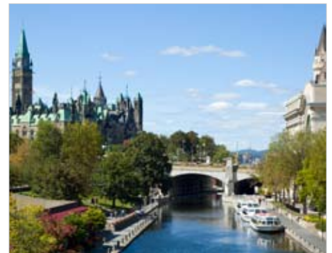
The 2008 AGM will be held in Ottawa, June 16–17