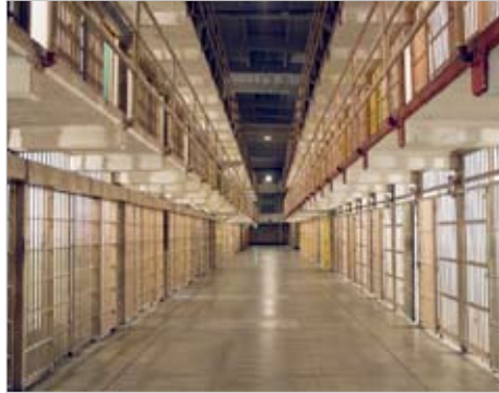
Needle exchange programs don’t exist inside Canadian prisons

Elliott, the health of prisoners is ultimately a public health concern.